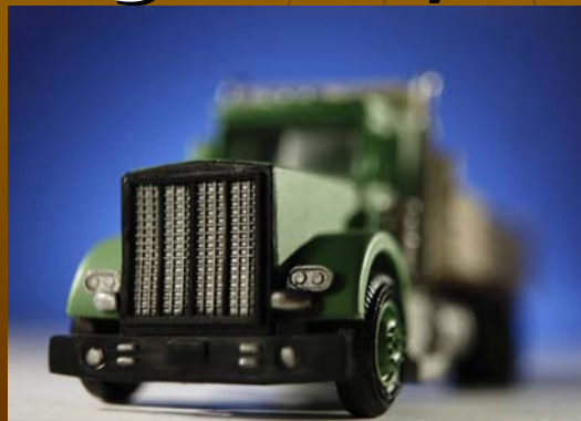
Cross, Gunter, Witherspoon & Galchus P.C.